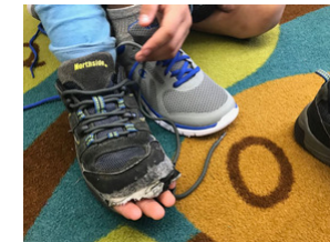
A child's worn-out shoe being swapped for a new one at Astor Elementary

OPERATION SCHOOL BELL EXPENDITURE: $70,316